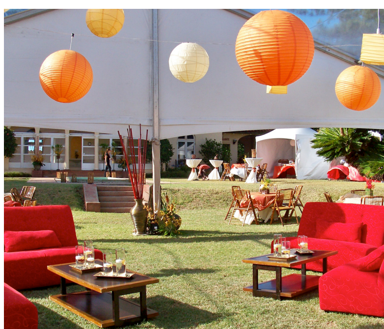
Rentals & Special Events