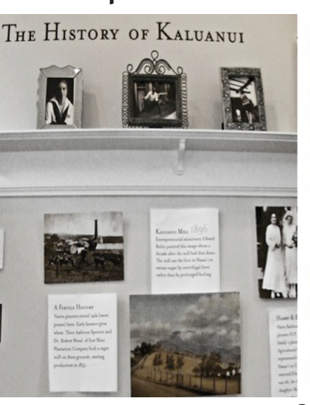
Het Notasi: A Home for the Arts