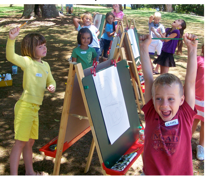
Camps & Field Trips