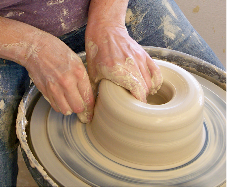
Classes & Open Studios