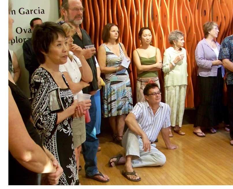
Exhibitions & Artist Chats