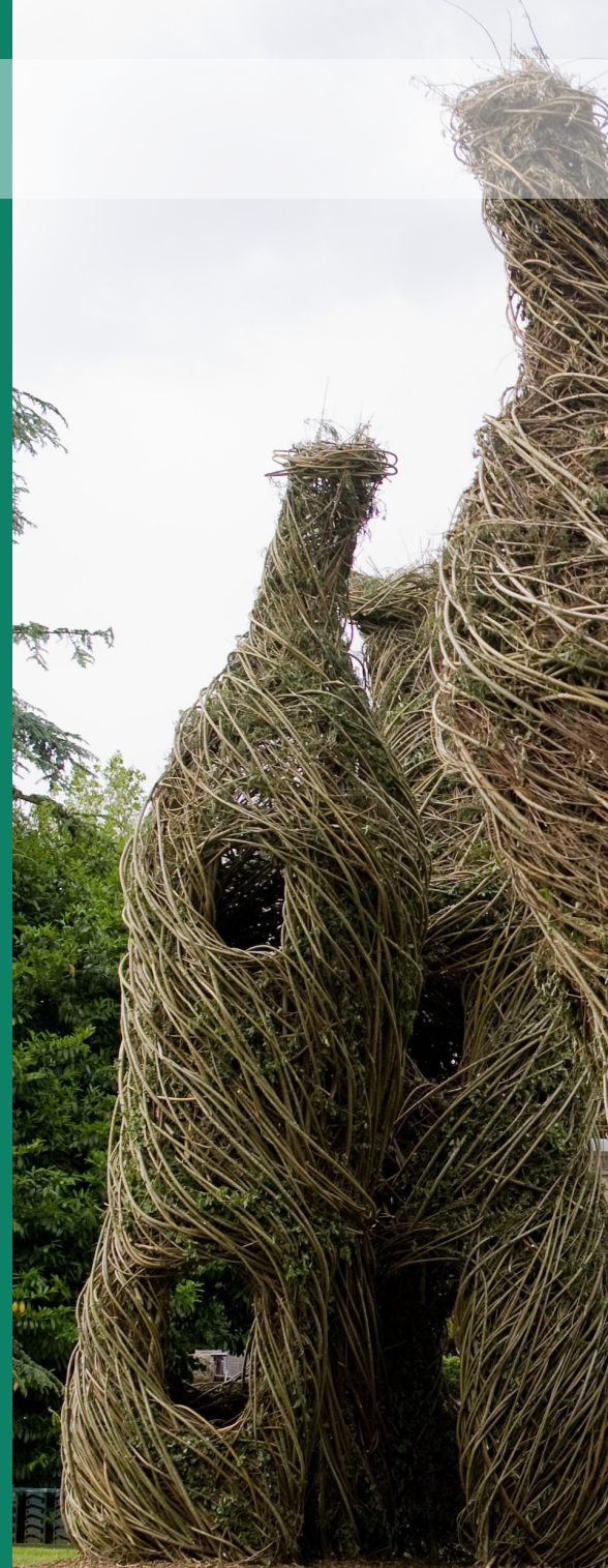
Sortie de Cave / Free At Last (2008) Jardin des Arts, Chateaubourg, France

This themed exhibition welcomes artists to investigate and creatively interpret the many ways in which "green" appears in our world. Whether inspired by nature, the environmental movement, the emotions this color provokes, or any other inspiration, artists are encouraged to develop and express an authentic vision of what "green" means to them. Visualizing Green will exhibit works that delve deep into creativity, engage the viewer in a thoughtful way, offer new insight, and demonstrate the profound importance and diversity of this omnipresent hue. All are welcome to participate!